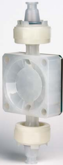
Specifically for the pharmaceutical market: Polypropylene pump heads