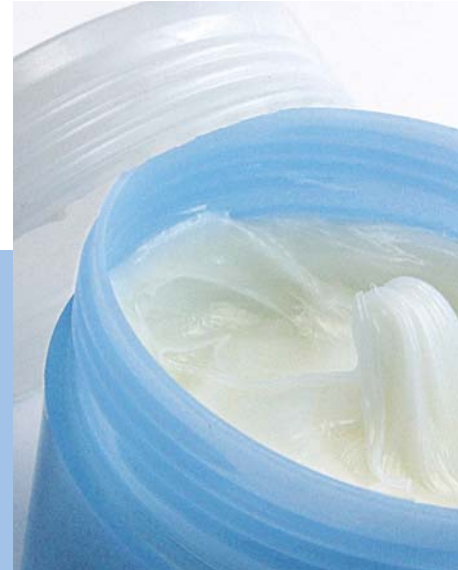
The cosmetics industry: LEWA diaphragm pumps with a hygienic design guarantee excellent cleaning for the production of personal care products for example.