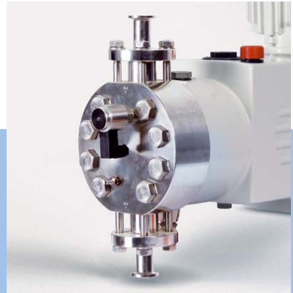
For medium to high pressures: LEWA ecoflow M900