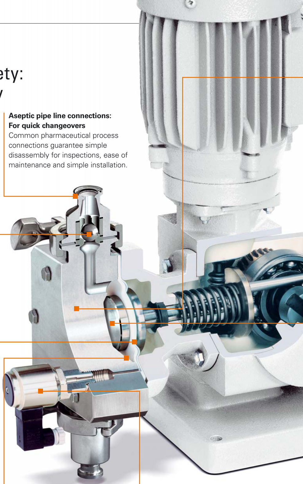
Photo: LEWA ecodos hygienic

The standard diaphragm monitoring system immediately and reliably indicates a damaged diaphragm. Nevertheless, the pump can still be operated to ensure production is completed without risks. Signalling occurs via a pressure switch, pressure gauge and contact pressure gauge.