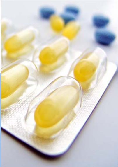
The pharmaceutical industry: LEWA diaphragm pumps in hygienic design meet the high demands of the pharmaceutical industry for extruding tablets for example.