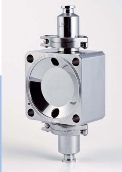
Hygienic design guarantees process integrity: LEWA ecodos made of stainless steel