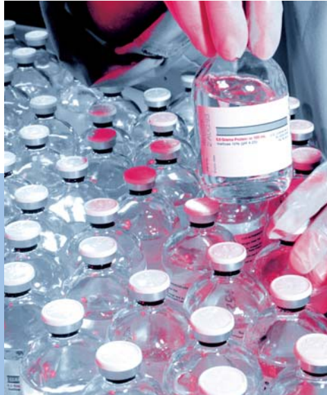
The biopharmaceutical industry: LEWA Diaphragm pumps and metering systems in up and downstream areas, for continuous sterile filling processes for example.