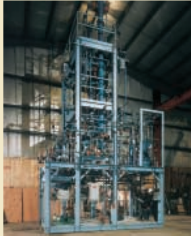
Glasteel® Pilot Plant Column/Reactor System