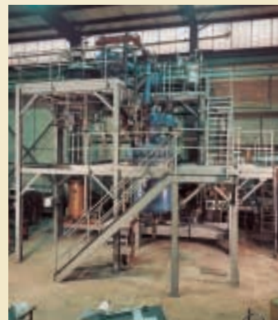
500 Gallon Glasteel® Reactor System