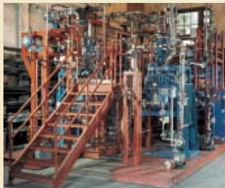
Pilot Plant Reactor System (2) 50 Gallon Glasteel® & (2) 50 Gallon SS Reactors with Lift Stands