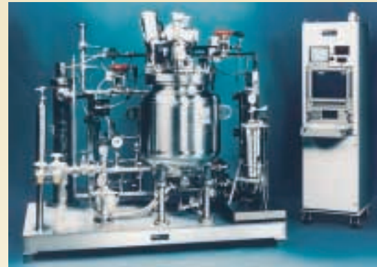
50 Gallon Reactor System Glass-Lined Stainless Steel