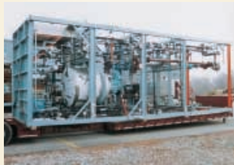
300 Gallon Glasteel® Reactor System