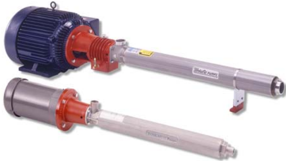
Figure 1: Tonkaflo SS Series pumps

As the industry standard for reverse osmosis (RO), Tonkaflo SS Series pumps (Figure 1) are backed by years of proven experience. The SS Series is a stainless steel multi-stage centrifugal pump with Noryl* plastic impellers. To reduce pump wear, SS Series pumps operate at lower speeds than single-stage pumps while achieving equivalent boost pressures. The SS Series' flexible, multi-stage design allows users to achieve their exact pressure requirements by adding or removing stages.